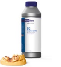
SG 3D printing material for surgical guides