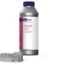
Model 2.0 3D printing material for dental models-high precision