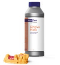
Gingiva Mask 3D printing material for gingiva mask