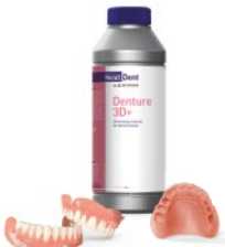
Denture 3D+ 3D printing material for printing denture bases