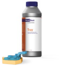
Tray 3D printing material for individual impression tray