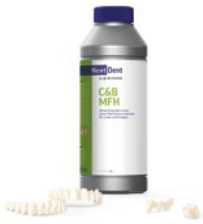
C&B MFH 3D printing material for micro filled crowns & bridges