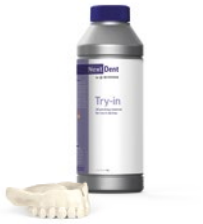
Try-in 3D printing material for try-in devices