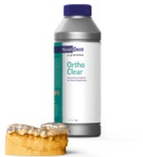
Ortho Clear 3D printing material for splints and retainers