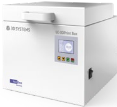
LC-3DPrint Box High-capacity UV post curing unit