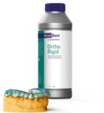
Ortho Rigid 3D printing material for splints