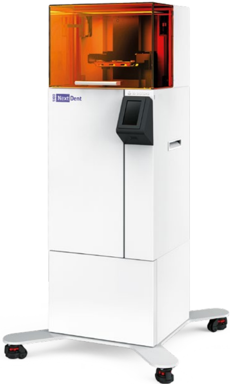
NextDent 5100 NexDent 5100 3D printer powered by revolutionary Figure 4™ technology