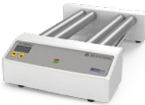
LC-3DMixer Roller /Tilting mixer for the mixing of 3D printing materials