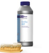
Ortho Indirect Bonding Tray 3D printing material for indirect bonding tray