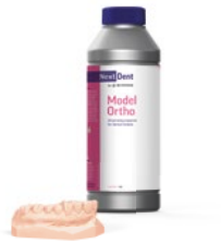
Model Ortho 3D printing material for dental models for vacuum casting applications