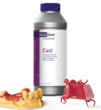
Cast 3D printing material for casting technique Residue-free easy burnout material